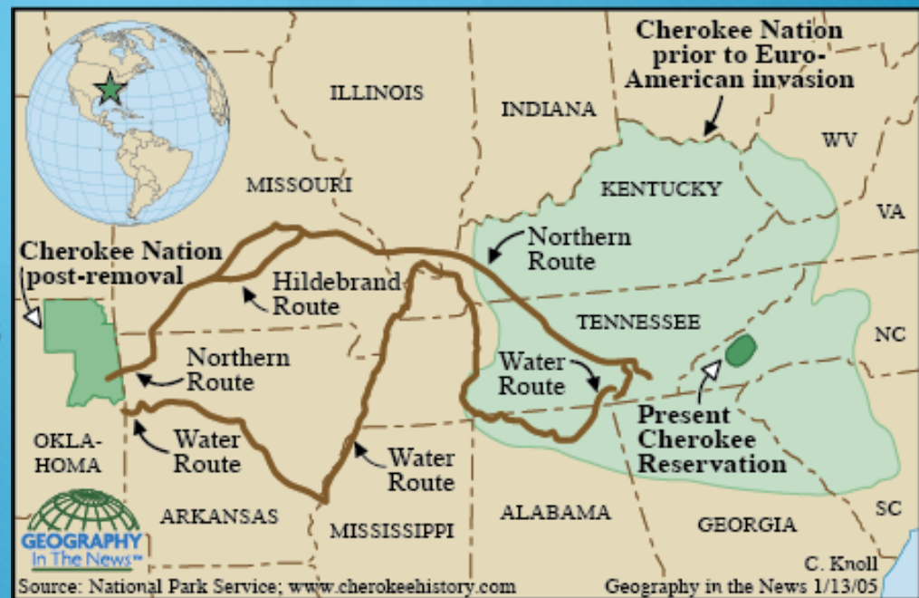
The Trail of Tears