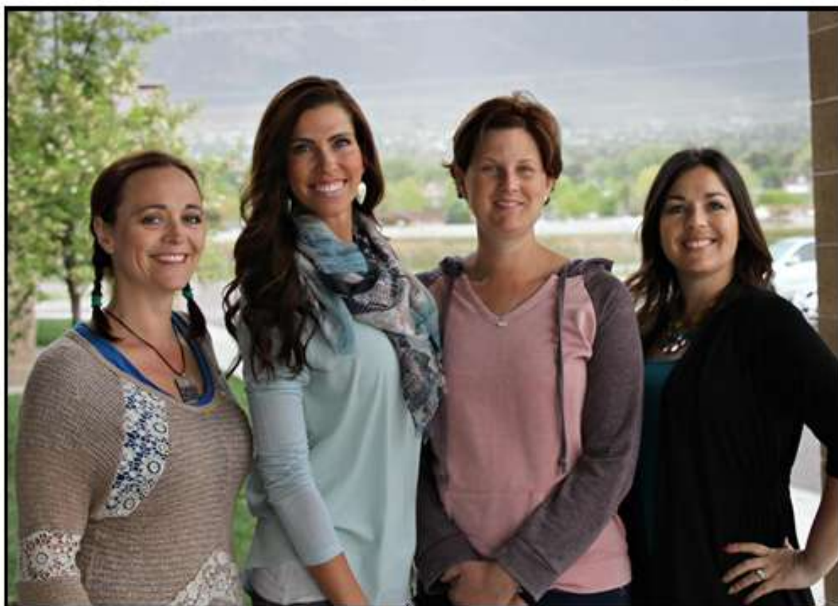
MAPA Board for the 2015-16 school Year

As parents we all support our children with their education. As a MAPA, we work collaboratively to support the school through many events and volunteer opportunities. Together we can ensure that every child succeeds. This is your MAPA and you are welcome and encouraged to attend all of our meetings and events. Together we strengthen our children's learning and our entire school.