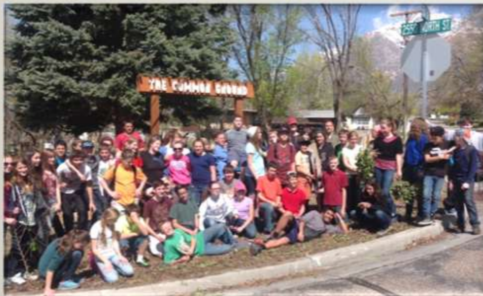
The Jr. High Students at the North Ogden Community Gardens

Orders will be ready for pick up May 29 th In the North Shore Parking lot beginning at 12:45 p.m. Once you pick up your order it will need to be delivered or placed in a freezer within 45 minutes. THIS IS THE LAST DAY OF SCHOOL!!!