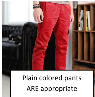
Plain colored pants ARE appropriate