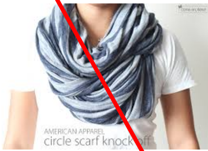
A scarf is NOT a collared shirt