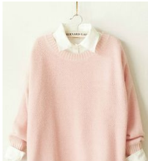
A Plain sweater over a collared shirt IS appropriate