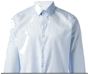
A plain collared button down shirt IS appropriate only when completely buttoned.