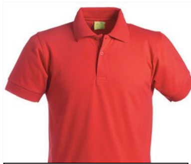
A plain collared shirt IS appropriate