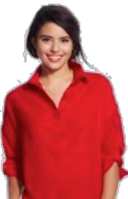
A plain collared button down shirt IS appropriate only when completely buttoned.