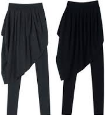
Leggings with a finger tip length skirt IS appropriate