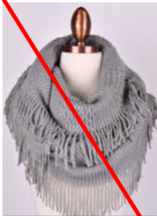
A scarf is NOT a collared shirt