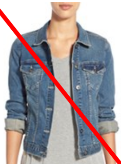
A denim jacket or vest is NOT a collared shirt