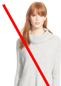
A turtleneck or cowl neck is NOT a collared shirt