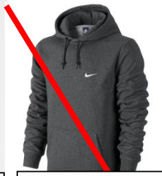
A hoodie is NOT appropriate