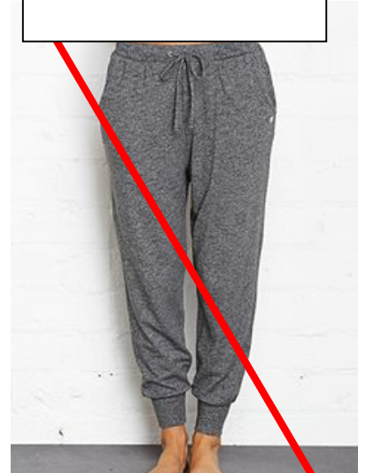
Sweat pants are NOT appropriate