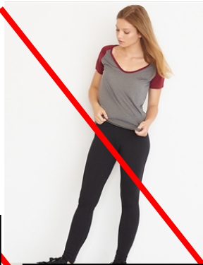
Leggings with just a shirt is NOT appropriate