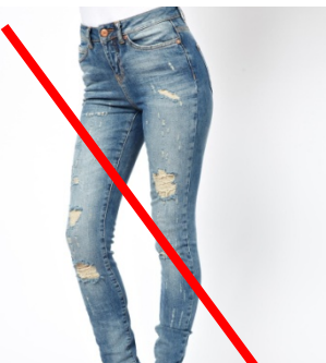
Torn pants are not appropriate