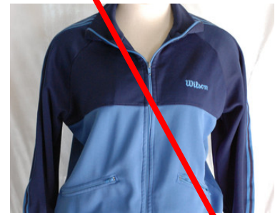
A sports jacket is NOT a collared shirt