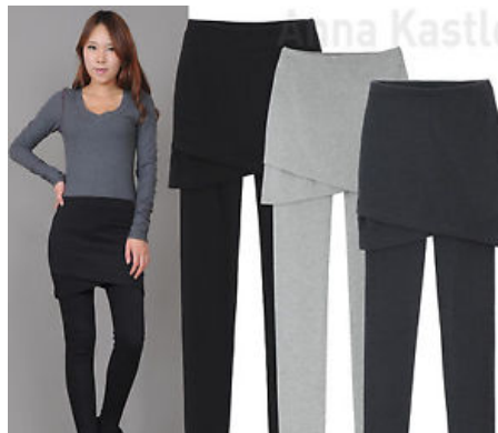
Leggings with a finger tip length skirt IS appropriate