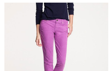
Plain corduroy pants ARE appropriate