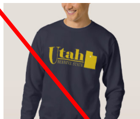
A sweatshirt with screen printing is NOT appropriate