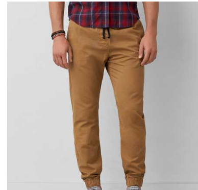
Plain Khaki joggers ARE appropriate