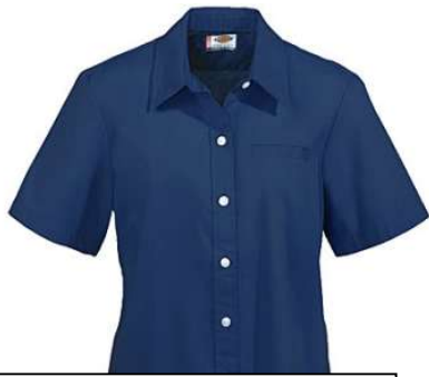
A plain collared button down shirt IS appropriate only when completely buttoned.