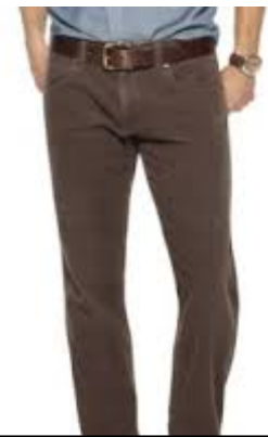
Plain corduroy pants ARE appropriate