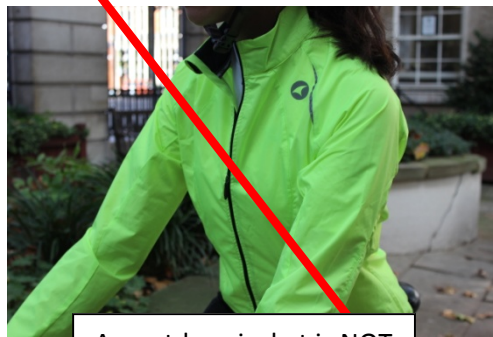
An outdoor jacket is NOT a collared shirt