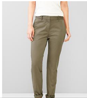
Plain Khaki pants ARE appropriate