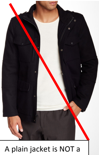
A plain jacket is NOT a collared shirt