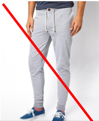
Sweat pants are NOT appropriate